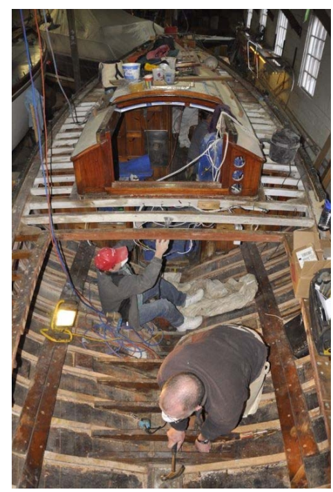
Worker bees - 2009/2010