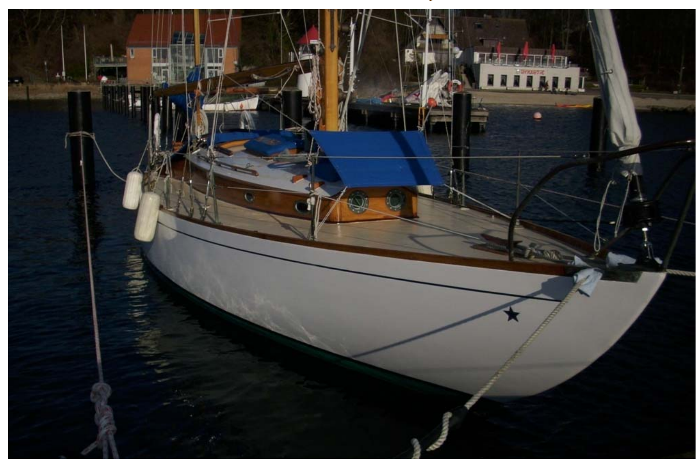
#20 FLEETWOOD back in the water - April 3, 2010