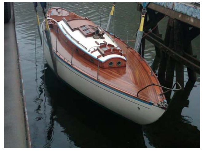
After new deck & cockpit - 2010