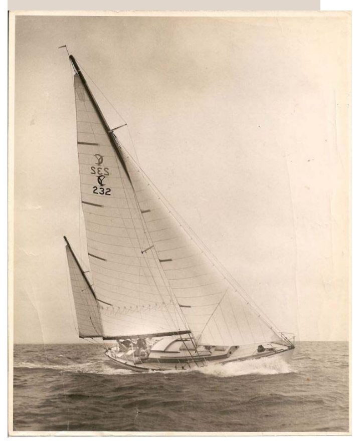
RAKA - maiden sail Padanaram - 1956