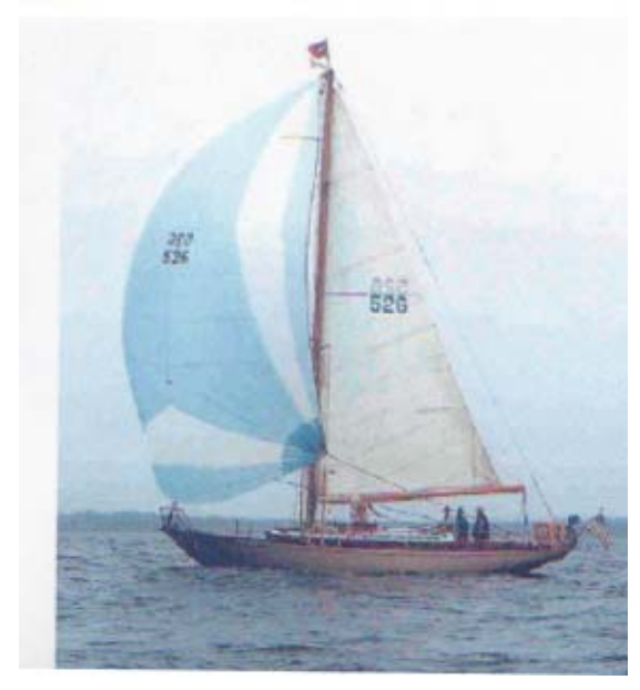
Fair winds Jim ... fair winds...