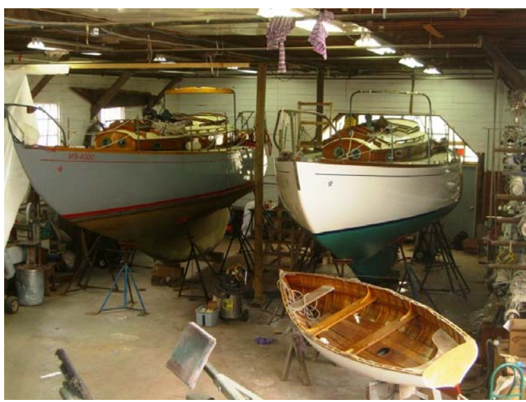
CROCODILE & RAKA keeping each other company 2007/2008